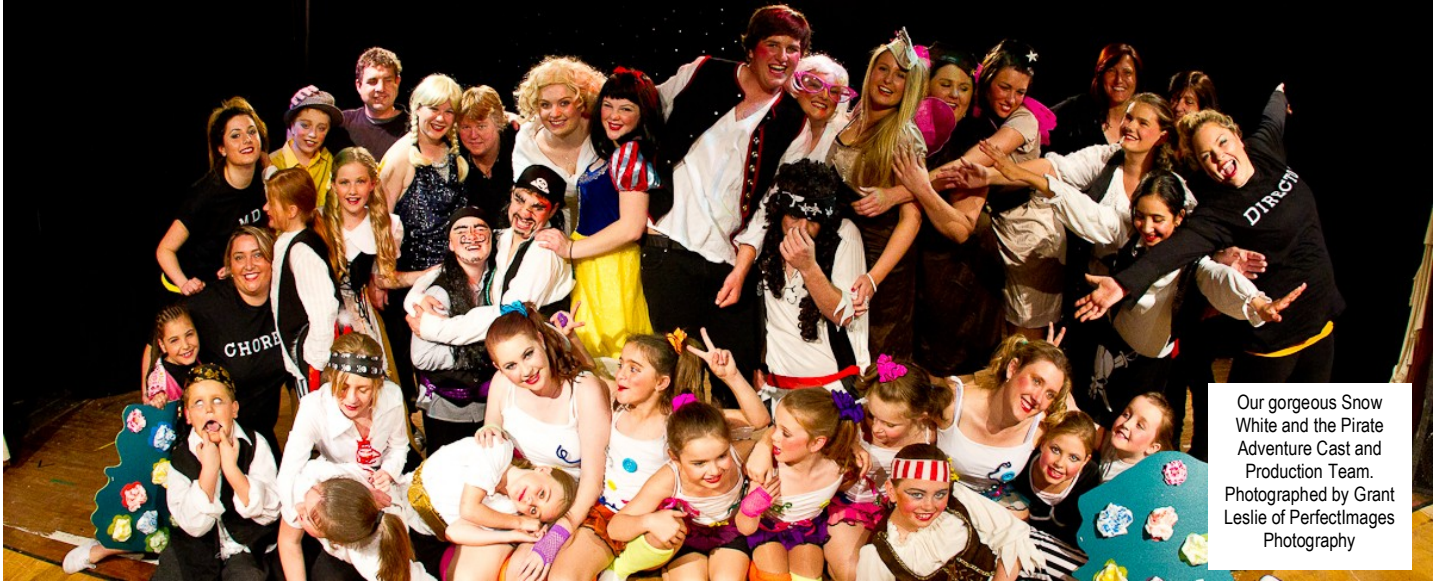
Our gorgeous Snow White and the Pirate Adventure Cast and Production Team.

Please excuse the baby issue this month! We are wonderfully busy and important! ;) Is it just me or are SMT members and friends looking more youthful than ever? Haha! Yes. That may have something to do with the fact that we are about to open our PANTOMIME tomorrow and we are so excited and tired and excited!!